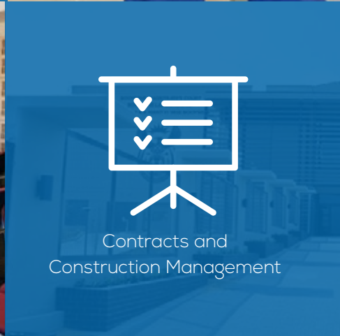
Contracts and Construction Management