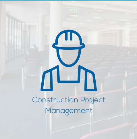
Construction Project Management